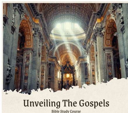
Unveiling The Gospels Bible Study Course

Tuesdays at St. Andrew Bobola Church in Winnipeg, MB from January 13 to March 24, 2026. – 6:30PM to 09:00PM (optional mass at 6pm) – TO SIGN UP CLICK HERE . For more information: 431-777-8877 or email ccrs@catholicrenewalservices.com For poster, click here .